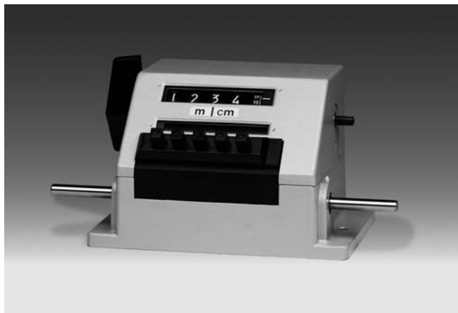
ME282 - PTB Meter counter